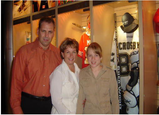
Sidney Crosby's family stop by to check out their son's hockey locker display.