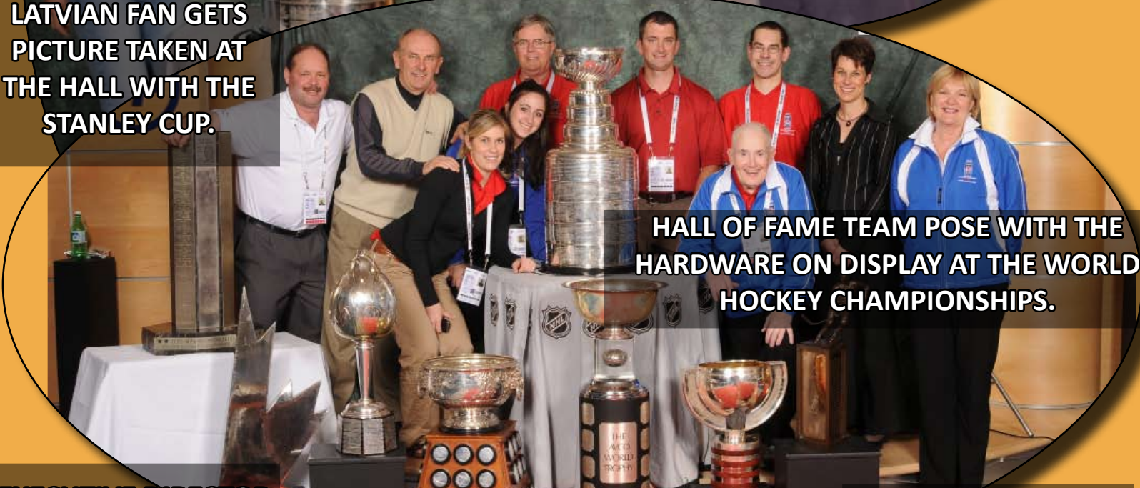
HALL OF FAME TEAM POSE WITH THE HARDWARE ON DISPLAY AT THE WORLD HOCKEY CHAMPIONSHIPS.