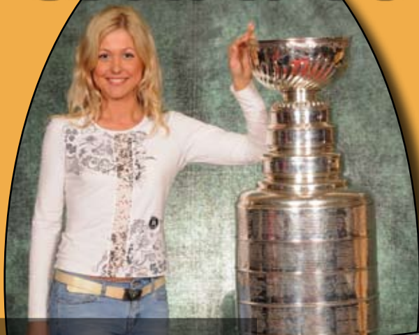
LATVIAN FAN GETS PICTURE TAKEN AT THE HALL WITH THE STANLEY CUP.