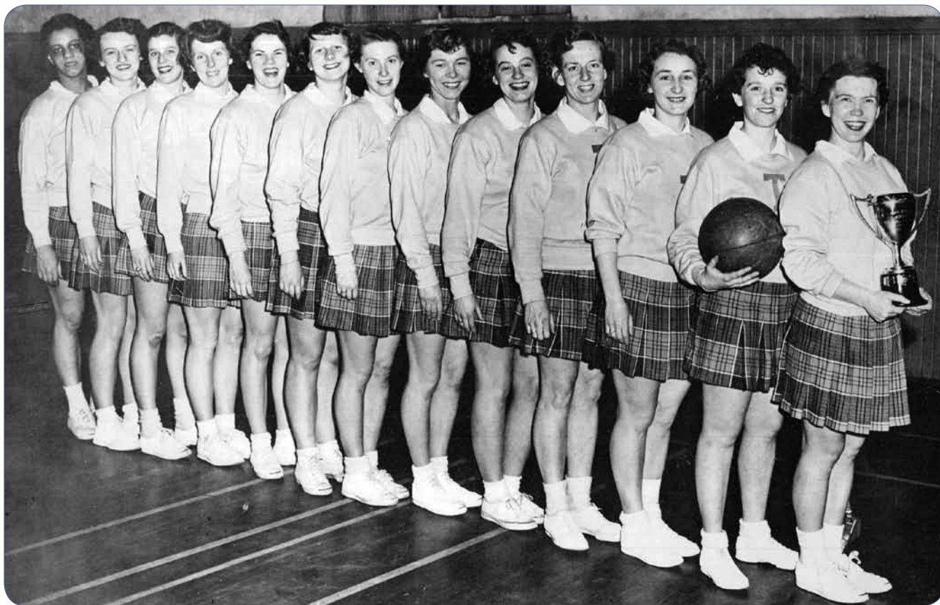
Halifax Tartans Senior Women's basketball team, Provincial Champions, 1952